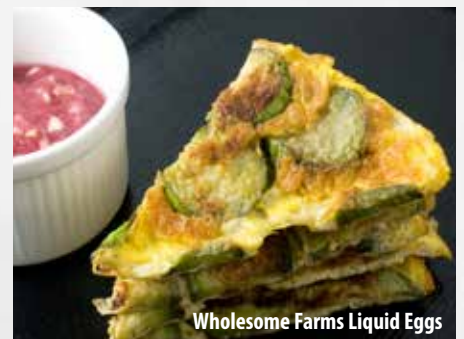
Wholesome Farms Liquid Eggs

Eggs become easier with Sysco's Wholesome Farms Liquid Eggs. Liquid eggs offer a labor-saving advantage to a busy breakfast daypart. With great taste and consistency, liquid eggs are the back drop to emerging ethnic flavors being added to eggs in North America.