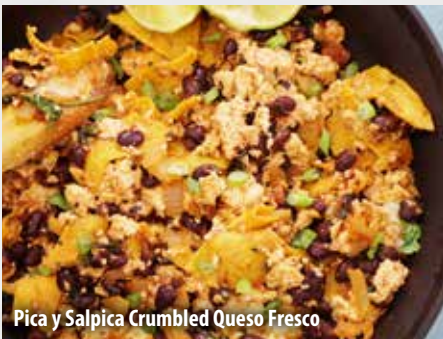
Pica y Salpica Crumbled Queso Fresco