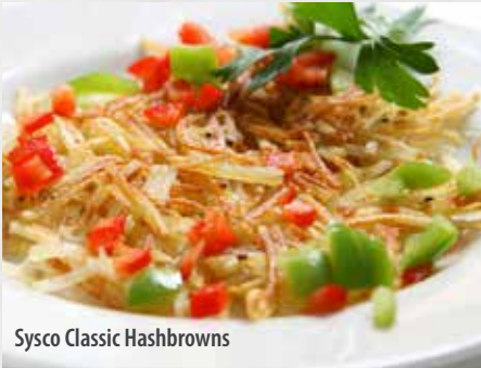
Sysco Classic Hashbrowns

This spring, refresh traditional breakfast items for broader appeal. Today's brunch menu includes everything from ethnic flavors and mash-ups to traditional staples like hams, quiches and eggs.