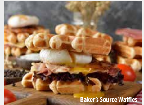
Baker's Source Waffles

Sysco offers Belgium and regular waffle mixes, as well as thaw and serve fully cooked waffles. Ask your Sysco Marketing Associate for the varieties in the Baker's Source brand. Waffles offer great appeal and can help you build plate profitability with their massive plate coverage and appeal. Spruce them up on your brunch menus by offering to top them with poached eggs and hollandaise for a twist on eggs benedict. Or, combine ricotta and smoked kielbasa with siracha for a savory flavor. Of course, don't forget the fried chicken option, too!