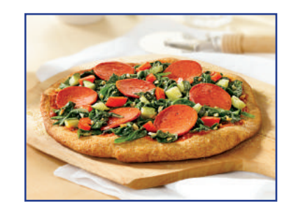
SUPC: 2979862 VEGGIE PIZZA PEPPERONI

Yves Veggie Cuisine™ also provides clientele with a variety of plant-based products to serve in their businesses. Our easy-to-prepare plant-based products require little preparation, but are delicious additions to any menu!