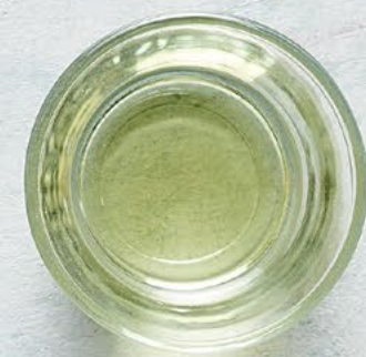
FRY-ON® This Sysco-exclusive combination of corn oil and high-oleic canola oil is a top choice for high quality foods. Recommended for fine dining.

such as sliced eggplant, sliced zucchini or whatever you have on hand. The key is the light coating and right frying oil. The ingredients should shine through and not taste greasy or loaded down with a heavy breading or batter. Top the dish off with chile flakes and a little sea salt and serve. If you've been hesitant to add more seafood to your menu, take heart. Proximity to a coast or lake is not a requirement, as Sysco distributes its high-quality, exquisite Portico Seafood all over the country. And a plate of ever-popular fish and chips or crisp and satisfying fritto misto is a great way to start.