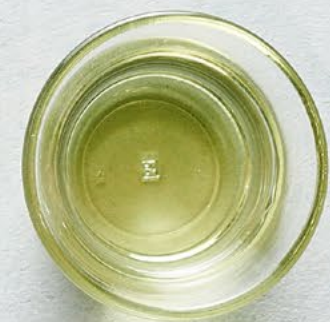
SYSCO IMPERIAL High-performance, high-oleic, low-linolenic, 100 per cent canola oil. Can be used in a variety of applications including frying, baking and grilling.