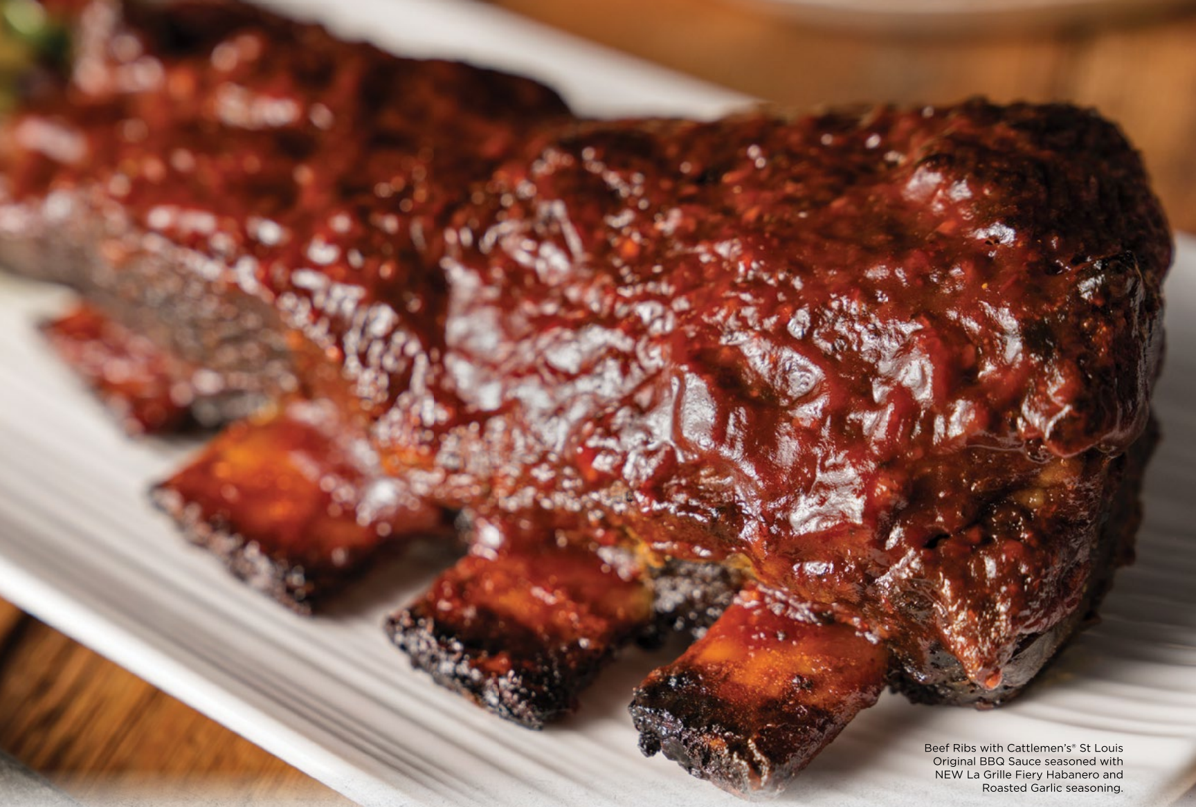
Beef Ribs with Cattlemen's® St Louis Original BBQ Sauce seasoned with NEW La Grille Fiery Habanero and Roasted Garlic seasoning.