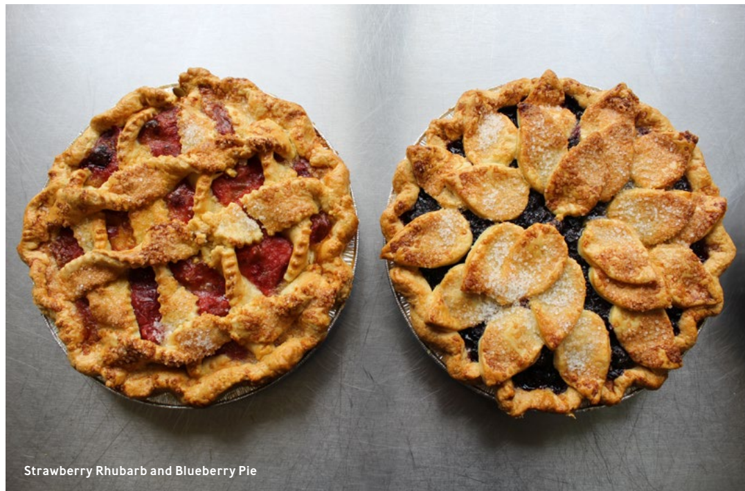
Strawberry Rhubarb and Blueberry Pie