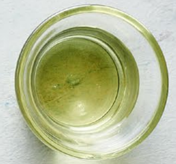
SYSCO CLASSIC This pure canola oil is a great value. Sysco Classic is recommended for high-volume kitchens where price is a factor.