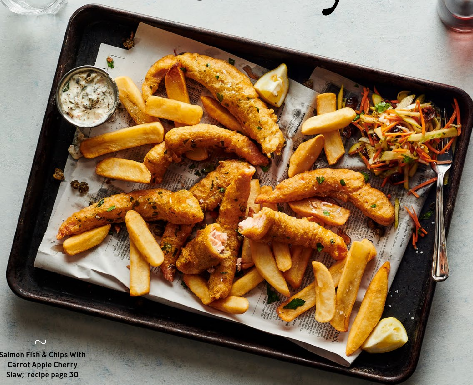
~ Salmon Fish & Chips With Carrot Apple Cherry Slaw; recipe page 30

Perhaps the best way to enjoy fried fish is by the ocean, where you can smell a salty breeze and watch the day's catch being hauled ashore. But the lack of a sea view doesn't stop landlocked consumers from ordering plenty of seafood. In fact, the lean, healthy protein and omega-3-packed nutrition of fish and shellfish have never been more in demand, whether you're on the docks of Vancouver or in downtown Winnipeg. This is especially true of irresistible fried fish. Whether it's breaded or lightly battered, everyone loves crispy, golden-brown seafood, especially when it is sprinkled with salt and pepper and paired with a tangy sauce.