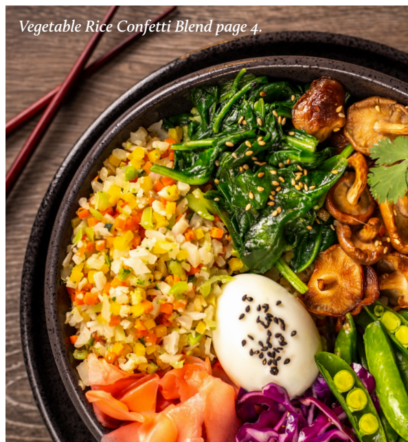
Vegetable Rice Confetti Blend page 4.