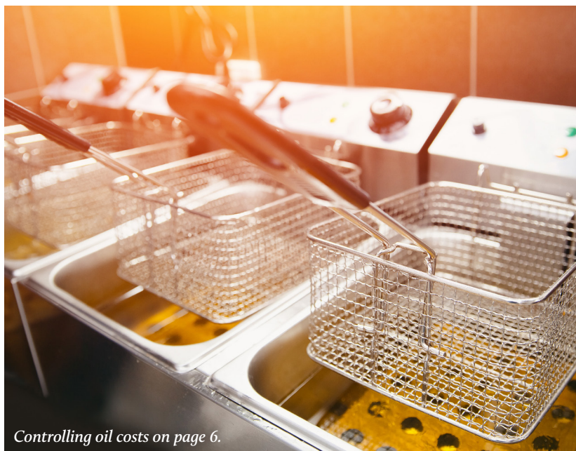
Controlling oil costs on page 6.