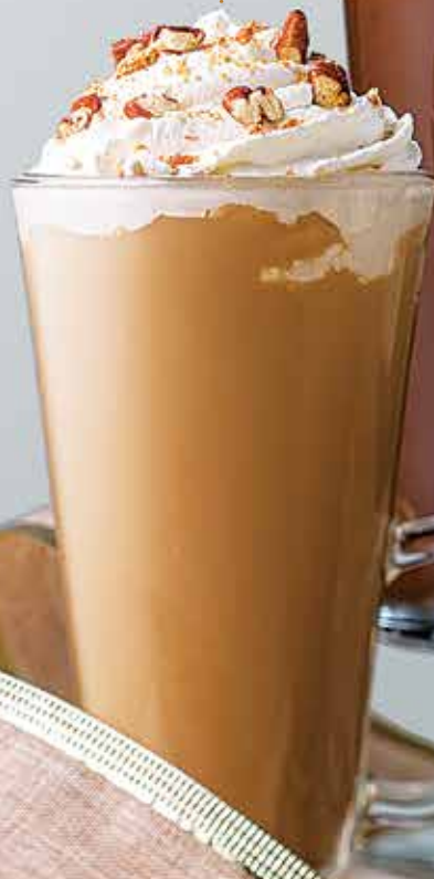
Mexican Churro Coffee