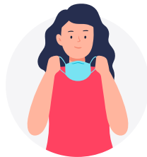
2. Hold the mask with the colored side away from you.