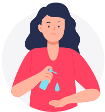
1. Clean your hands with soap and water or hand sanitizer

Contact your Sysco Marketing Associate for product details and availability