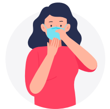
5. Pull the bottom of the mask over your mouth and chin.