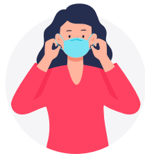
3. Hold the mask by the ear loops and place a loop around each ear.