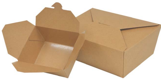
2-Compartment (SUPC: 4567273)

Your Earth Friendly Takeout Solution Sustainable solution for takeout and delivery applications.