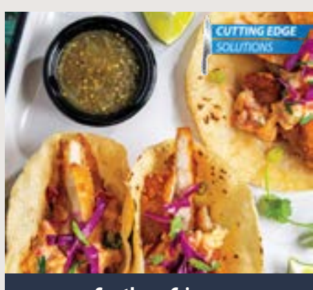
Southern Crispy Chicken Tacos

As seen recently on @SyscoFoodie on Instagram