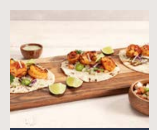
Chili and Cumin Rubbed Shrimp Tacos