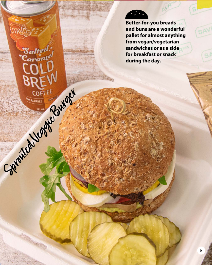
Sprouted Veggie Burger

Better-for-you breads and buns are a wonderful pallet for almost anything from vegan/vegetarian sandwiches or as a side for breakfast or snack during the day.