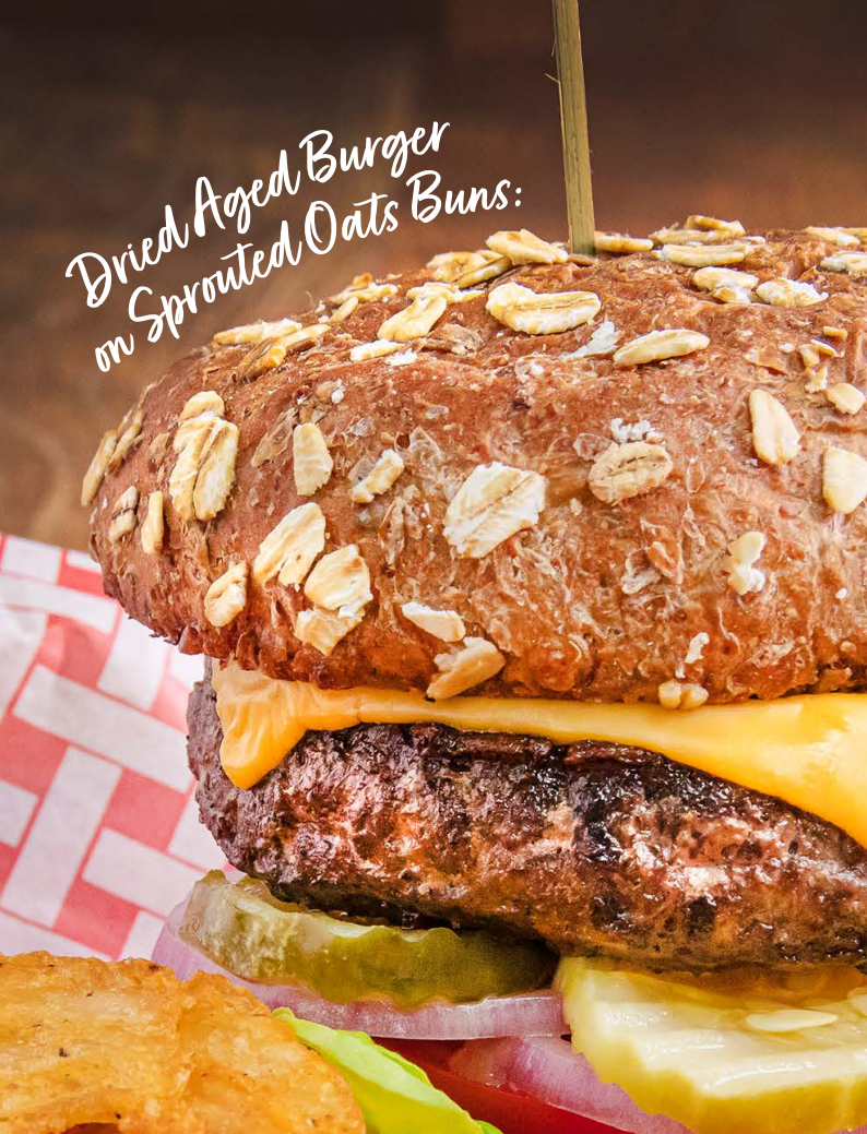
Dried Aged Burger on Sprouted Oats Buns: