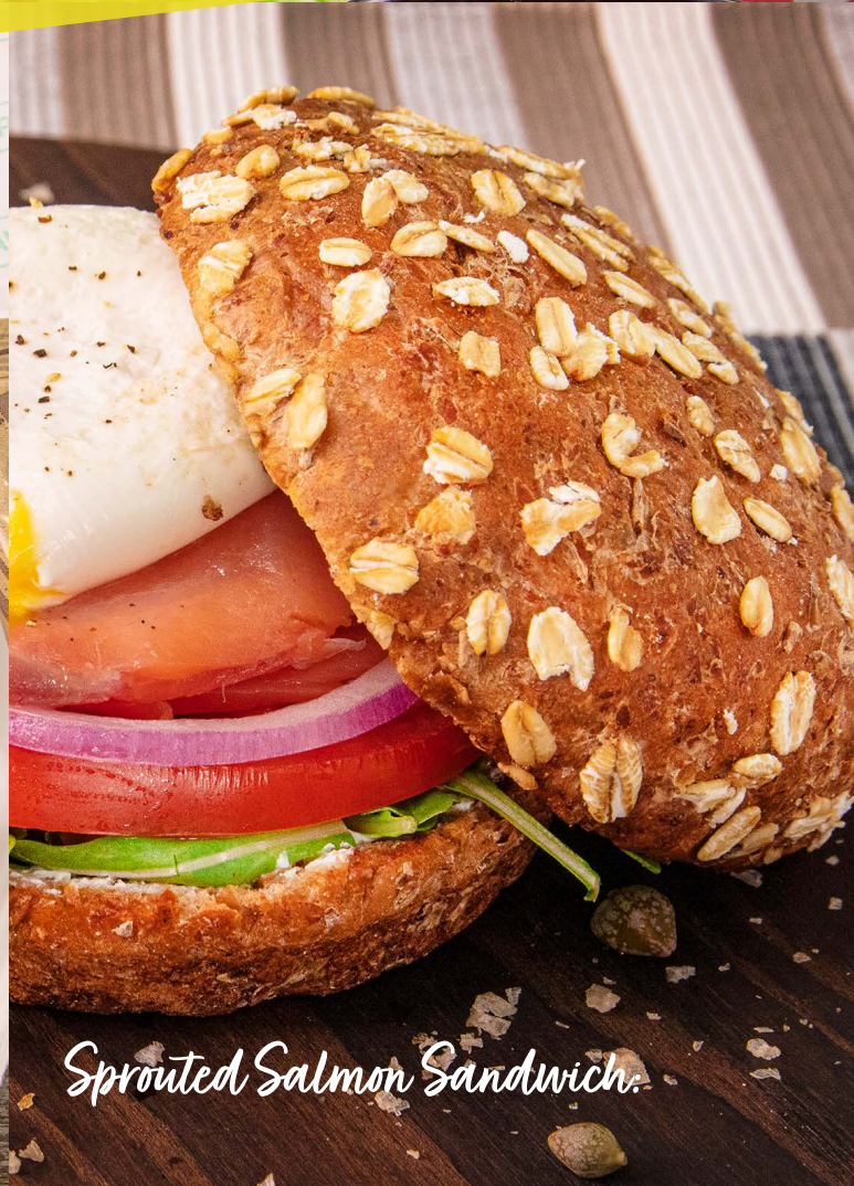
Sprouted Salmon Sandwich.