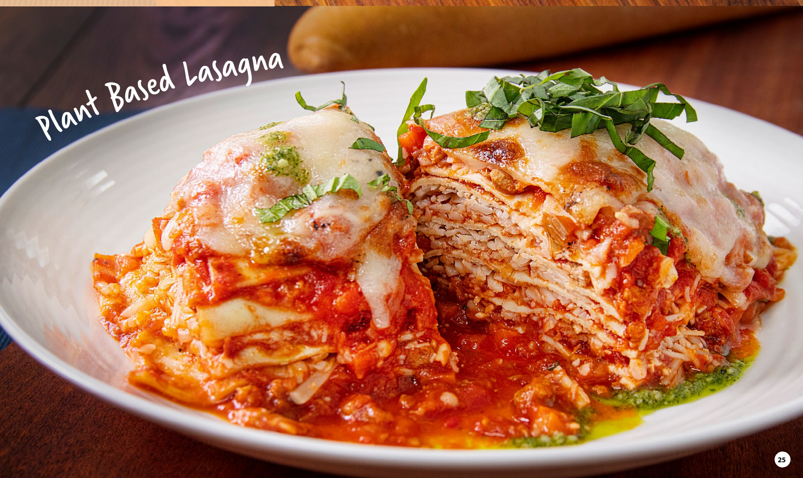
Plant Based Lasagna