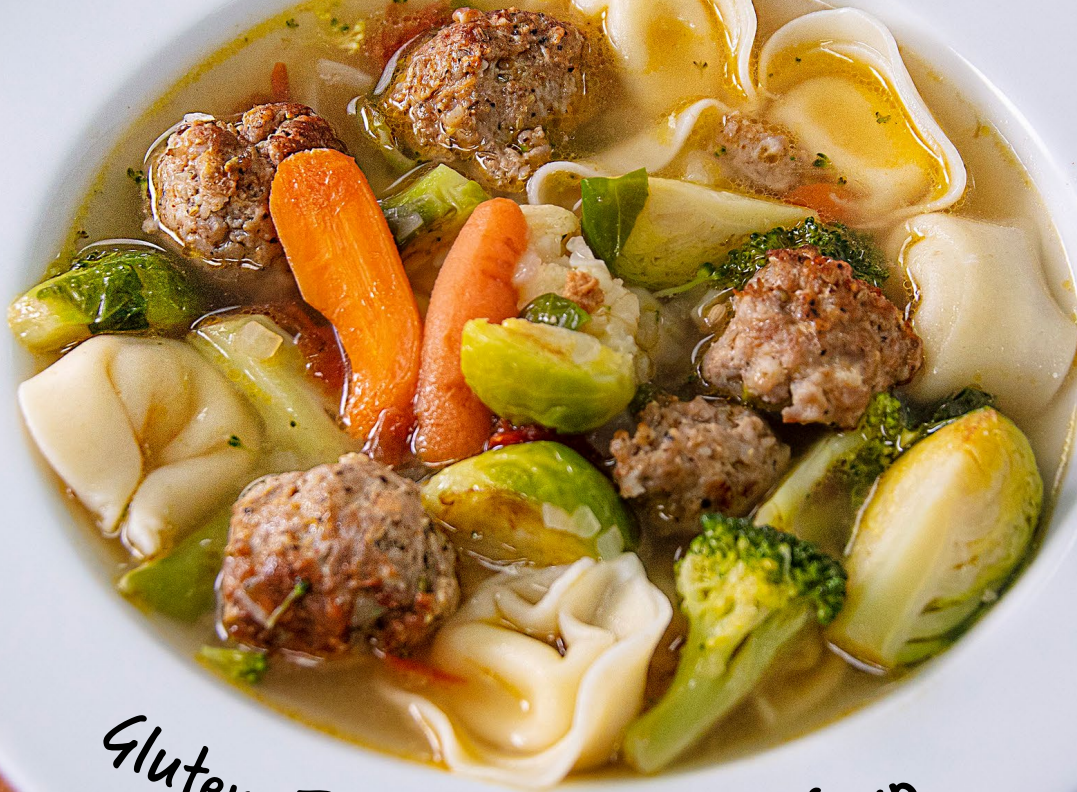
Gluten-Free Italian Wedding Soup