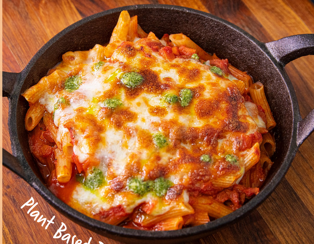
Plant Based Baked Ziti