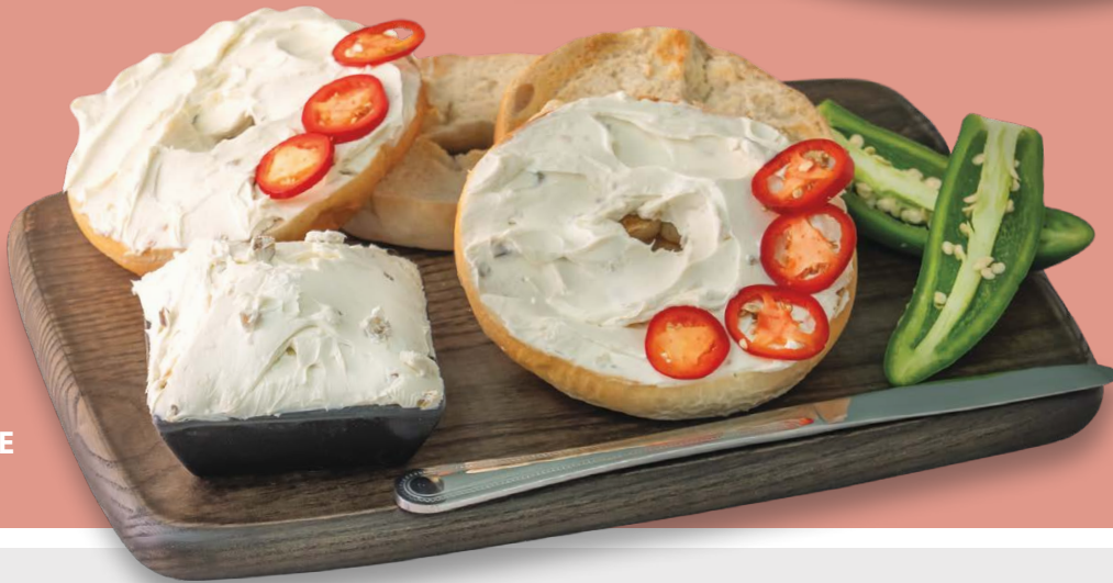
P.10 WHOLESOME FARMS JALAPEÑO CREAM CHEESE SPREAD