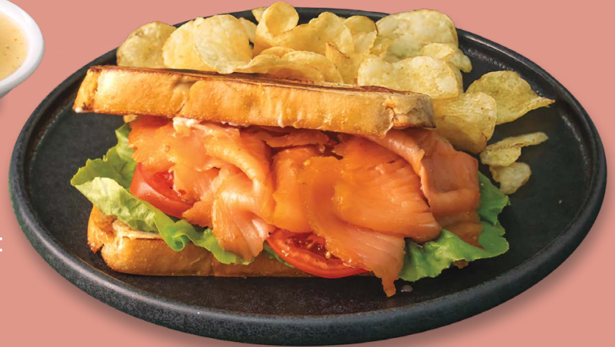
P.8 PORTICO CLASSIC HOT HONEY COLD SMOKED ATLANTIC SALMON