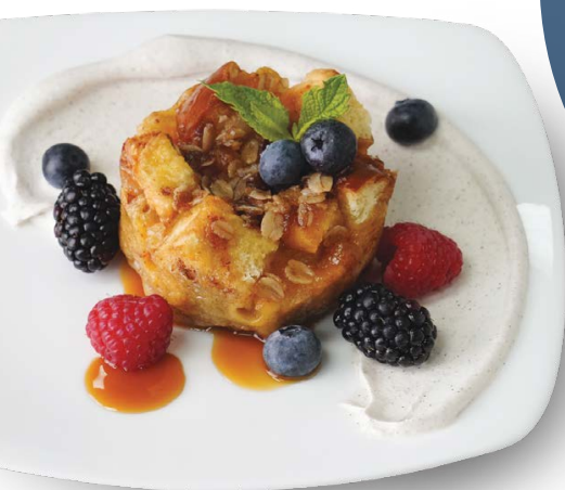
SYSKO CLASSIC Peach Crisp Brioche Bread Pudding SUPC 7414115 • 24/5 OZ