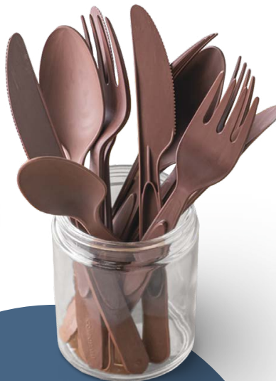
EARTH PLUS Agave-Based Compostable Cutlery CUTLERY KIT SUPC 7311239 • 250 CT SPOON SUPC 7311252 • 1000 CT FORK SUPC 7311250 • 1000 CT KNIFE SUPC 7311248 • 1000 CT