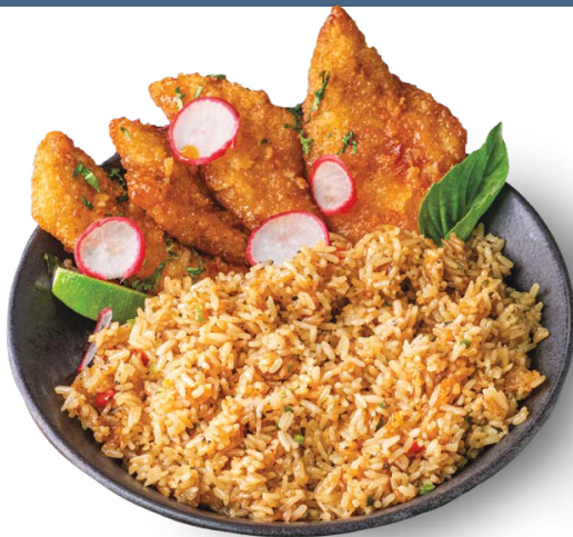
JADE MOUNTAIN CLASSIC Thai Style Chili Basil Fried Rice SUPC 7385441 • 4/3 LB