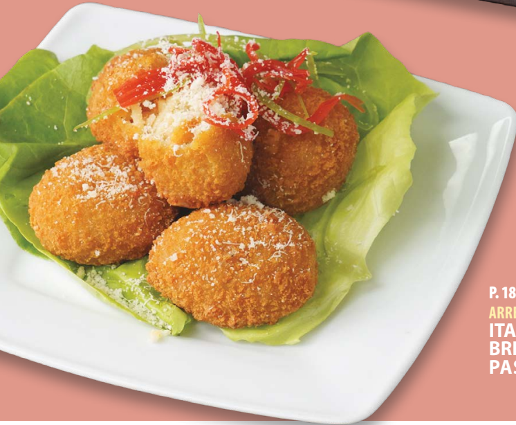
P. 18 ARREZZIO CLASSIC ITALIAN BREADED PASTA BALLS