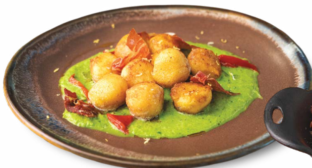
ARREZIO CLASSIC Italian Stuffed Gnocchi FOUR CHEESE SUPC 7407795 • 4/2.5 LB CREAMY TRUFFLE SUPC 7407790 • 4/2.5 LB