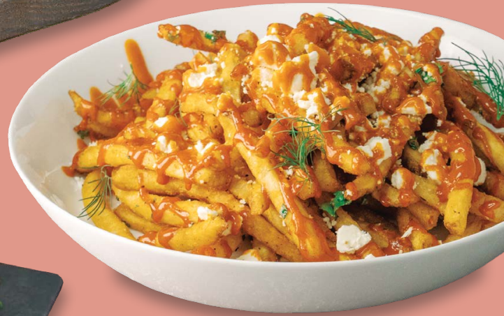
P. 14 HEINZ SMOKY HARISSA AIOLI