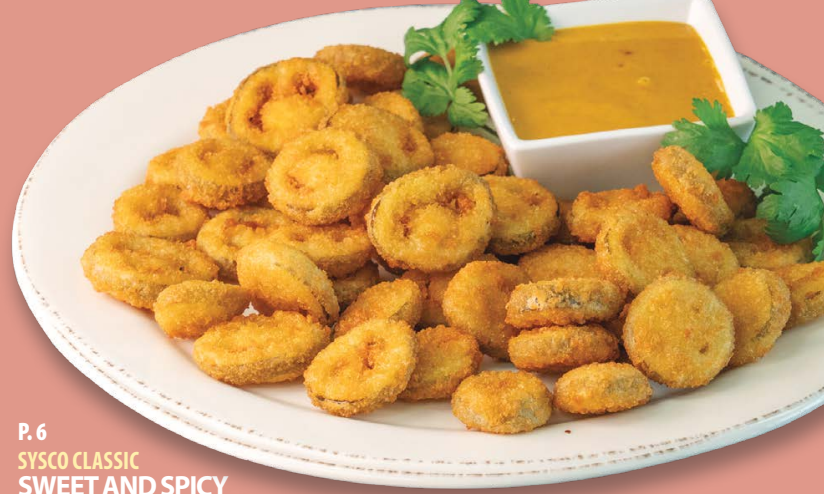
P.6 SYSCO CLASSIC SWEET AND SPICY "COWBOY CANDY" BREADED JALAPEÑOS