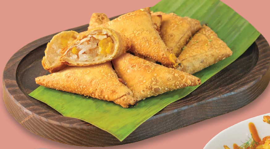
P. 12 JADE MOUNTAIN SWEET MANGO COCONUT STICKY RICE WONTON