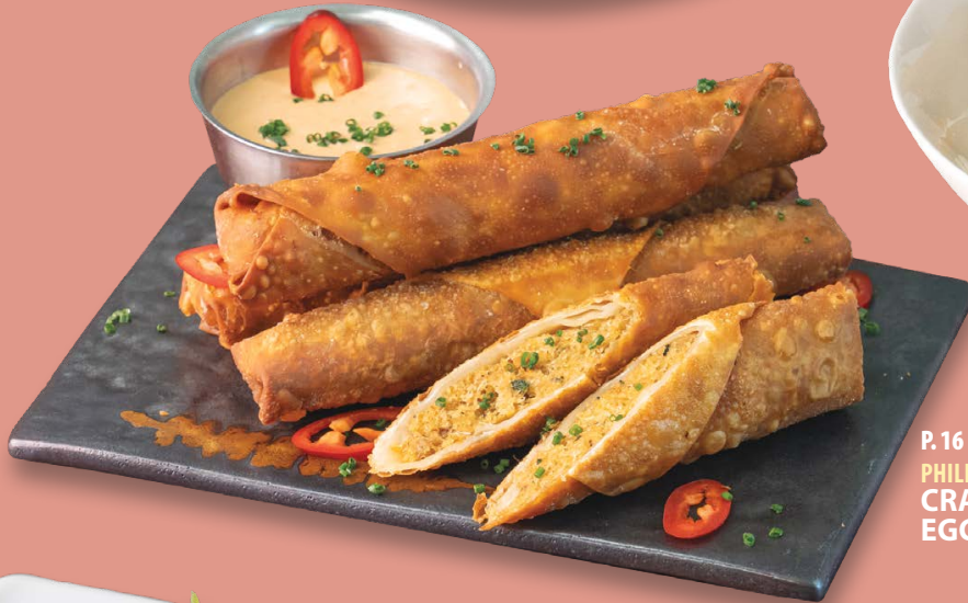
P. 16 PHILLIPS FOODS CRAB CAKE EGG ROLL