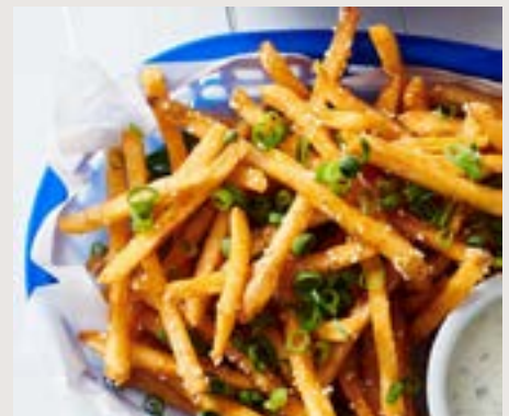
Peri Peri Fries