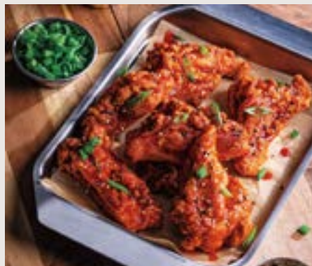
Korean-Style Boneless Thigh Wings