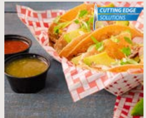
Cauliflower Simply Protein (Pulled Oats) Tacos Vegan