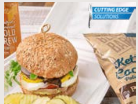
Sprouted Veggie Burger

For more great recipes, check us out at https://foodie.sysco.com/recipes/