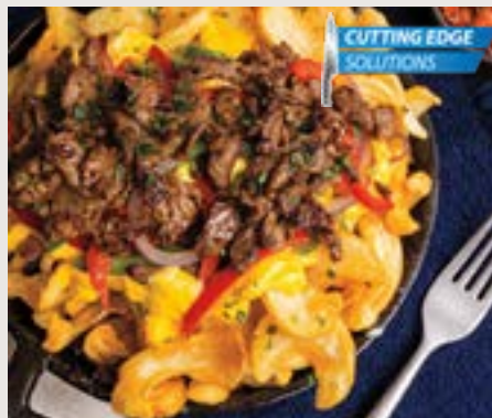
Loaded Philly Junior Cut Sidewinders Bowl