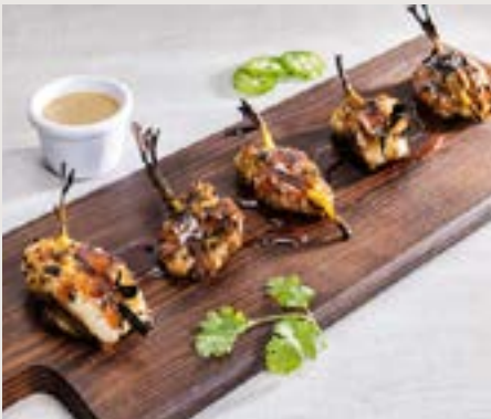
Chicken Thigh Thai (Gai Yang)