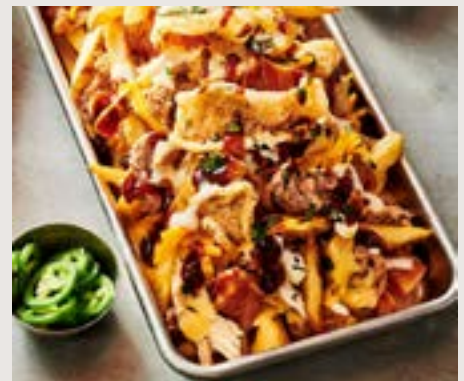
Pig Skin Loaded Fries