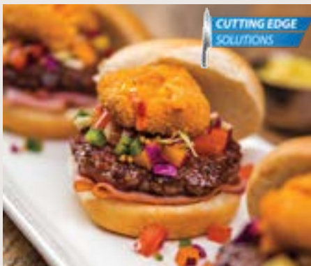
Smoked Ham & Pimento Cheese Bite Sliders