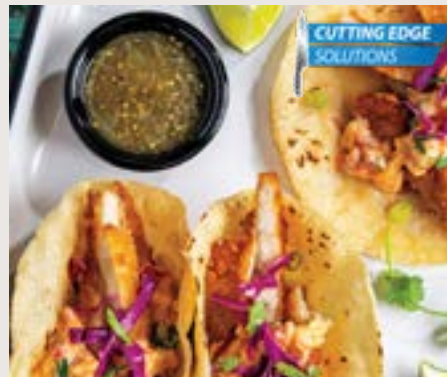
Southern Crispy Chicken Tacos