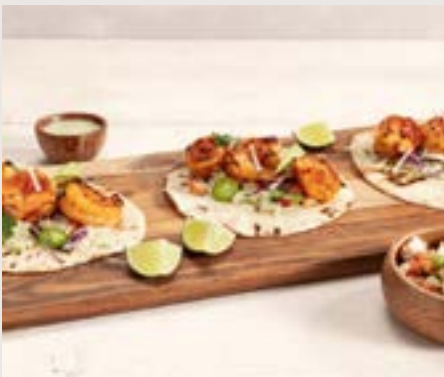
Chili and Cumin Rubbed Shrimp Tacos