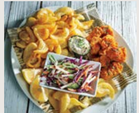
Buffalo-Spiced Fish & Twisted Chips