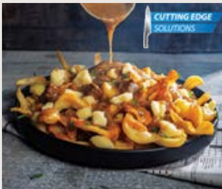
Junior Cut Sidewinders Poutine

CLICK ON PICTURE TO ACCESS THE RECIPE ON FOODIE.SYSCO.COM AND ADD THE INGREDIENTS TO YOUR CART