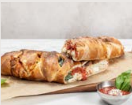
Pepperoni, Sausage and Capicola Stromboli